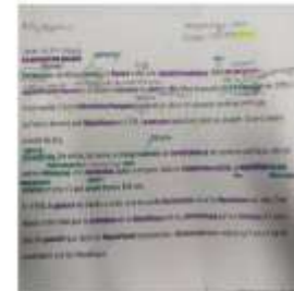
Milly (Y9 Reading Group) Reading strategies to decode a text about French politics